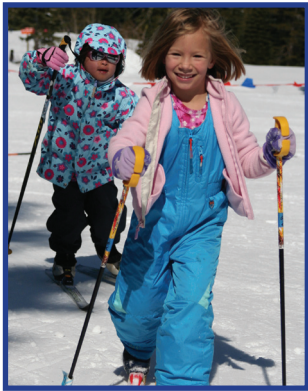
ASC's youth Nordic programs are a fun way for kids to learn to ski.