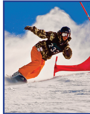
ASC Snowboard athletes complete regionally and internationally. In 2010 the Snowboard program was named by USSA the number one domestic team in the country.

I would like my donation to go to (please check box(es):