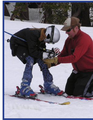
Auburn Ski Club coaches build fundamental skills in our athletes.

From the beginning skier/snowboarder to the elite level athlete our goal is to put and keep kids and families "on-the-snow" for a lifetime. Our motto, " Recruit – Retain – Develop ", is a common thread that runs through our programs and honors our ASC legacy. Because the Training Center operation is an in-kind donation to the ASC Associates 100% of your donation will go directly to the programs and athletes. Your financial support will make it possible to keep team dues affordable and enable us to provide scholarships at all levels. It's that simple, your donation will put junior skiers and snowboarders on the snow. We hope you will choose to support our great organization and help Auburn Ski Club Associates athletes follow their dreams and excel in winter sports for a lifetime.