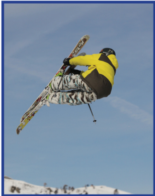
The ASC Freestyle team competes in the "new School" disciplines of Slope style and Halfpipe.