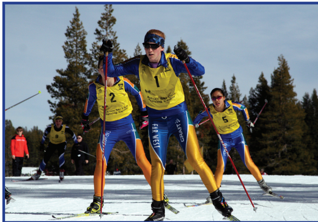
ASC's Nordic Development and Competition teams train teenagers to compete at the highest levels.