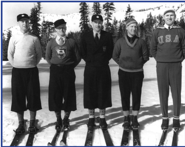
Auburn Ski Club Ski Jumpers at the Cisco Ski Grounds on old Highway 40. In the 1930's and 40's ASC jumpers competed across the west and at the Olympic level.

Auburn Ski Club Associates, founded in 1964, traces its heritage to 1928 when the original Auburn Ski Club was formed. By 1932 the founders vision and efforts had persuaded the State legislature to open Highway 40 year-round ushering in modern California skiing. The Club's Cisco Ski Grounds boasted the first engineered Ski Jump in the west and was where many Northern Californians first experienced skiing. Always promoting winter sports, ASC staged Ski Jumping exhibitions in 1934 and 1935 on the UC Berkeley campus and on Treasure Island for the 1939 World Exposition.